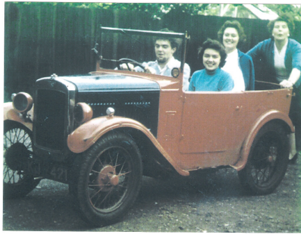
Teddington, approx 1956