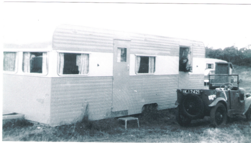
On holiday, Pagham, near Bogner 1958

Sadly that is the only history we have of little Bluebelle, other than: - Born in Kent, and lived in Kent for the last 12 years, but a delight to know something of her life and reacquaint her with a past owner.