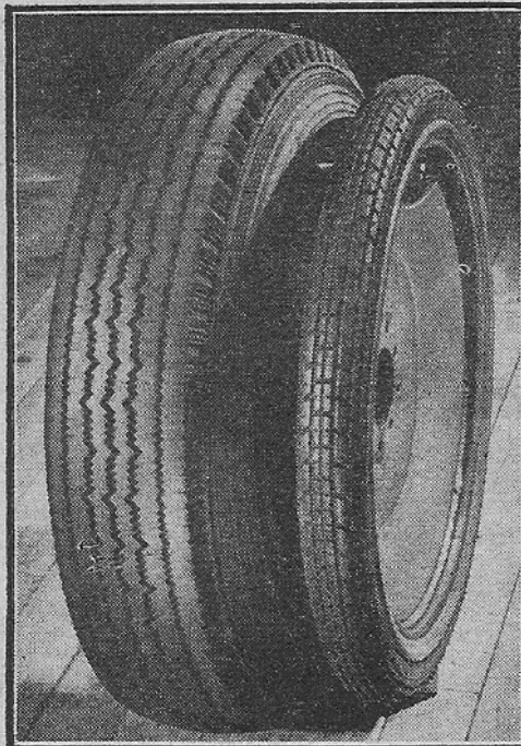
The Dunlop get-you-home spare wheel device.

I MENTIONED last month that some manufacturers are proposing to eliminate the spare wheel, and I quoted from a lecture given by the manager of Dunlop's Tyre Design Division as saying that none of the devices produced for dispensing with the spare wheel is satisfactory although some progress has been made with a simplified tyre and wheel construction. I have since obtained some information on this method. Although tubeless tyres have lessened the hazards of punctures, the size and shape of the puncturing object is unpredictable and the ordinary tubeless tyre cannot be claimed to be completely puncture-proof. Experiments have been going on for some time at