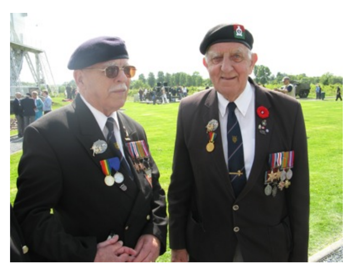
Veterans at Pegasus Bridge Museum

I can whole-heartedly confirm, however, as a result of this episode, that the recovery service provided with insurance offered by RH Specialist Insurers, Brentwood, (many of us are with that company, I know) is absolutely first-class. The recovery vehicle was with us within 45 minutes and we were home roughly 45 minutes later, though the ride proved to be a 'white-knuckle' one!