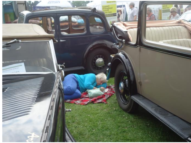
Rallies are exhausting!