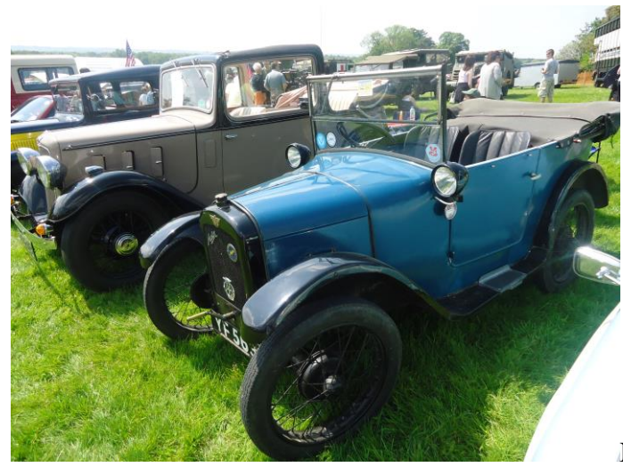
Nice to see you, Noddy!