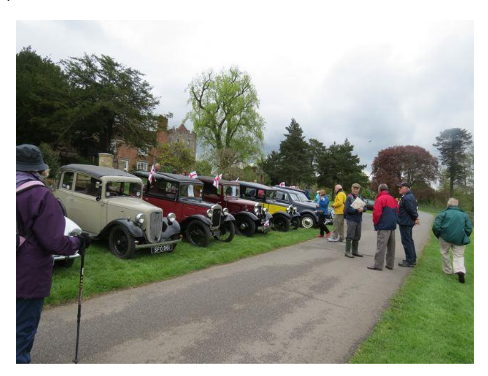
Enjoy the fine weather, while it lasts and trouble-free motoring!

A total of 15 assorted vehicles assembled at Wellington Farm Shop café, prior to this year's run on April 27<sup>th</sup>. This image shows just a few of them parked up in a prominent position, in front of Greys Court, the National Trust property near Henley on Thames.