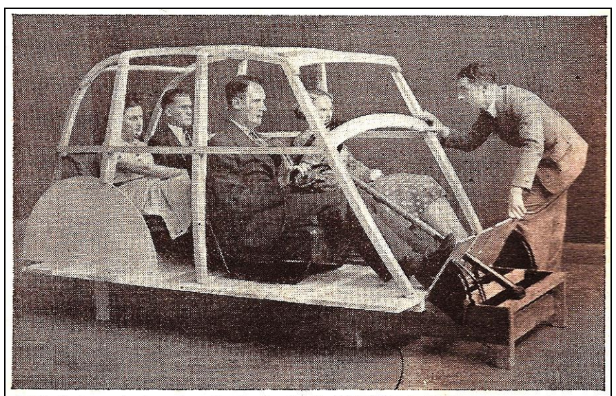
The "Queries of the Month" are reproduced with the kind permission of the Austin Ten Drivers Club (ATDC)

This photograph shows how the bodies for the 1935 Morris "8" cars were designed to accommodate four persons in comfort.