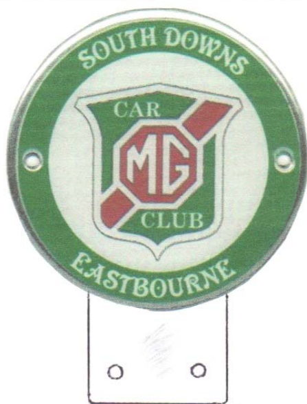
BADGE BAR FIXING

When ordering you may mix and match the type of fixing you require. For example, if three badges are ordered two may have radiator fixings and one badge bar fixing, but you cannot mix and match the background colours. Either green or blue background preference should be stated and the majority choice will be ordered.