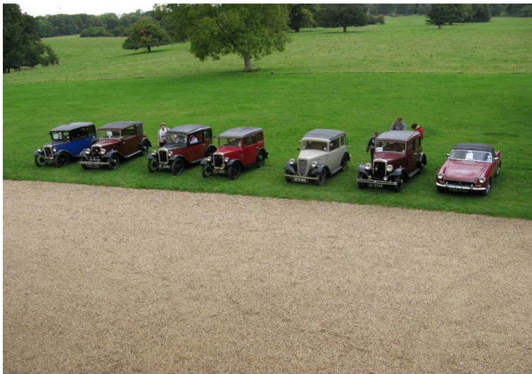
The line-up at Basildon Park