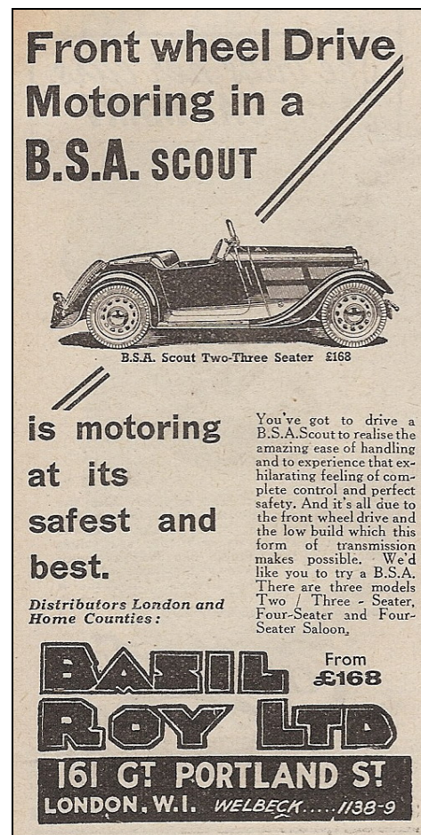
Sporting BSA Scout (New)