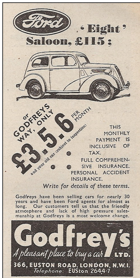
Bargain Ford Eight (New)