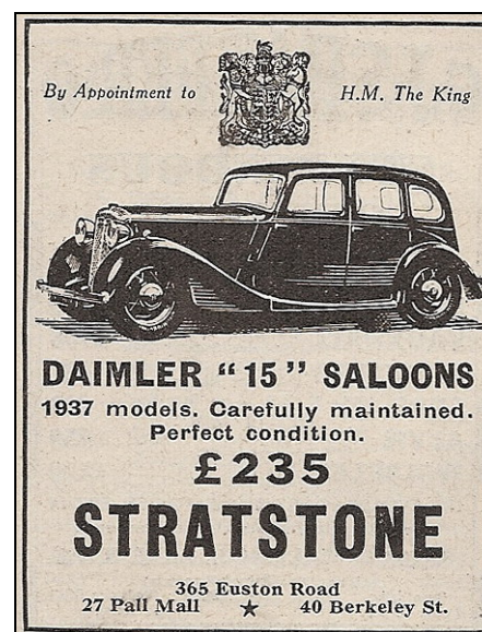
Luxury Daimler (Used)