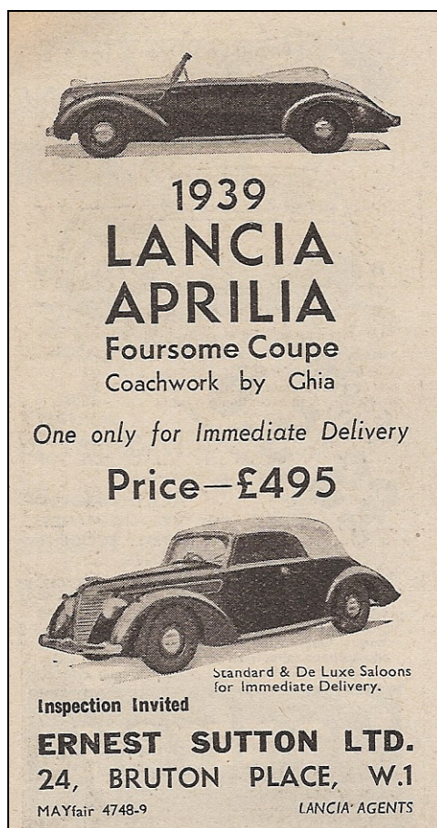
Superb Lancia Aprilia (New)